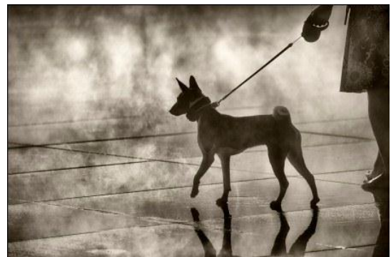
Leader of the Pack by Fikry Botros

“I am fascinated by the inexhaustible variety of opportunities everyday life offers me as a photographer.” explains Botros. “My approach is to look for these unique and expressive moments where they exist without any need to create or modify them. I use photography to slow life down so I can savor its offerings. This becomes a self fulfilling prophecy; the more you search, the more you find. I am drawn to the ability of black and white photographs to convey complex emotions with much less information than color photographs.”